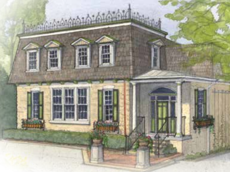
Rendering by J. B. Nicholson Architecture/Illustration